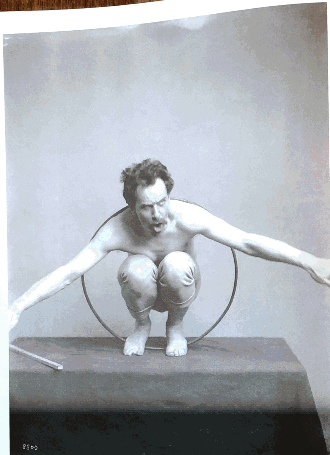
8300 Franz Boas posing for a figure in U.S. Natural History Museum display case entitled "Hamat'sa coming out of secret room," date not recorded (1895 or before). National Anthropological Archives, Smithsonian Institution, Washington, DC

Above, Franz Boas is seen modeling for a diorama on the Hamat'sa. He is depicted as the "wild" dancer emerging from the threshold of the supernatural and out of the mouth of Baxwbakwalanuksiwe'. The diorama Kwakwaka'wakw were brought to Chicago as part of the World's Columbian Exposition. In 1893 a group of the Hamat'sa over and over again to an uninitiated audience, setting in motion a cycle of repetition and reiteration of the ritual that carries through to the present.