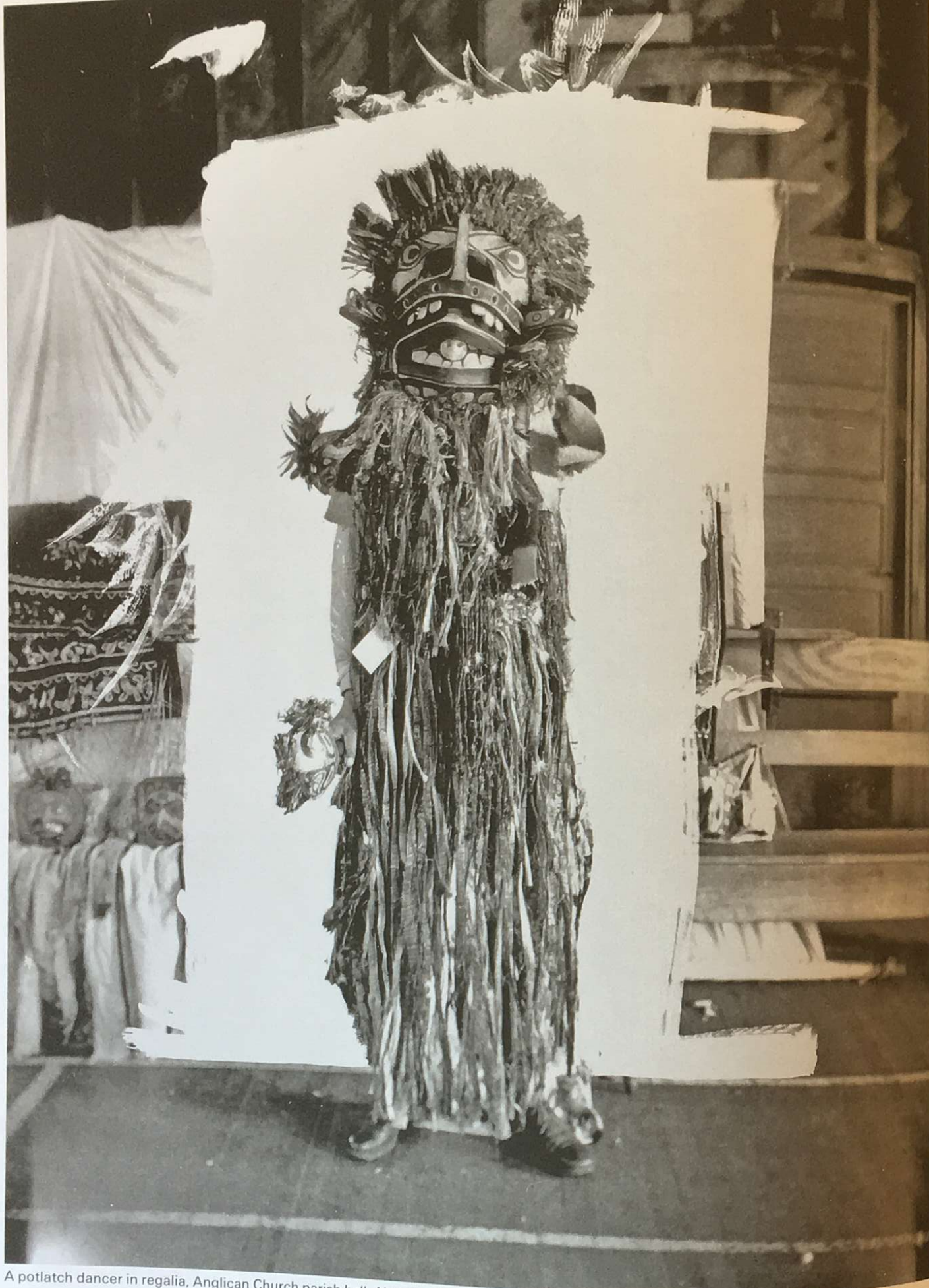
A potlatch dancer in regalia, Anglican Church parish hall, Alert Bay, BC, ca. 1922.