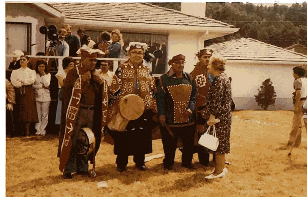
Nuyumbalees Cultural Centre, Cape Mudge, BC, 1979. Royal BC Museum and Archives, Victoria

The Kwakwaka'wakw people make clear that dance is not only a celebration; it is an integral part of their judicial system and governance. They declare that "a strict law bids us to dance." 3 In 1975 when the return of the first set of objects taken after the potlatch of 1921 was made official, people in Cape Mudge and Alert Bay celebrated with dances that were not simply celebratory.