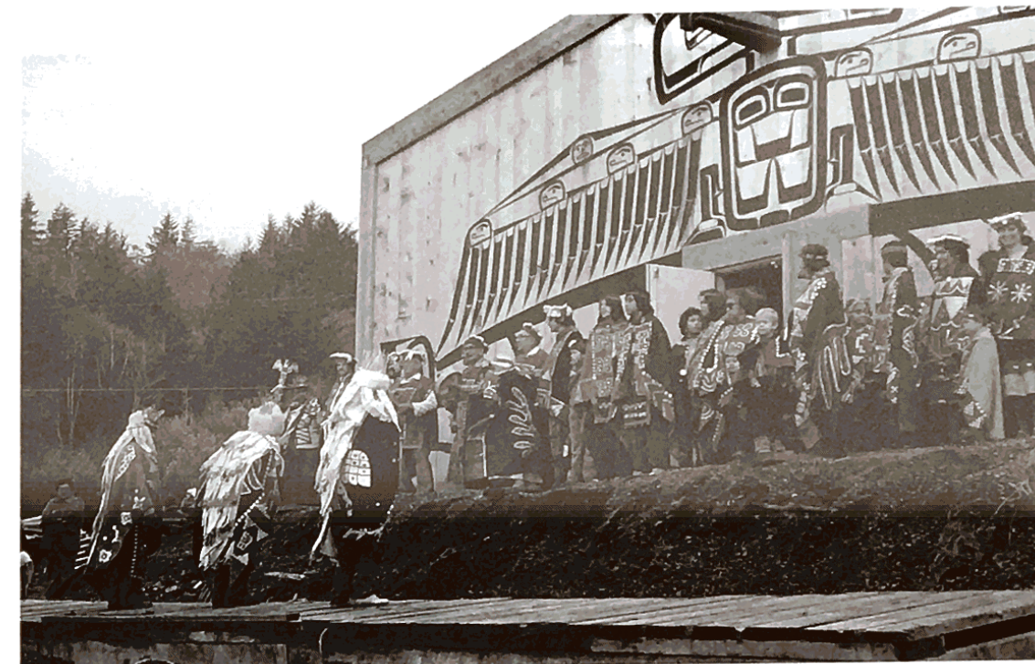
Kwakwaka'wakw community members celebrate the opening of the U'mista Cultural Centre in Alert Bay, BC, date unknown.

Above, Franz Boas is seen modeling for a diorama on the Hamat'sa. He is depicted as the "wild" dancer emerging from the threshold of the supernatural and out of the mouth of Baxwbakwalanuksiwe'. The diorama Kwakwaka'wakw were brought to Chicago as part of the World's Columbian Exposition. In 1893 a group of the Hamat'sa over and over again to an uninitiated audience, setting in motion a cycle of repetition and reiteration of the ritual that carries through to the present.