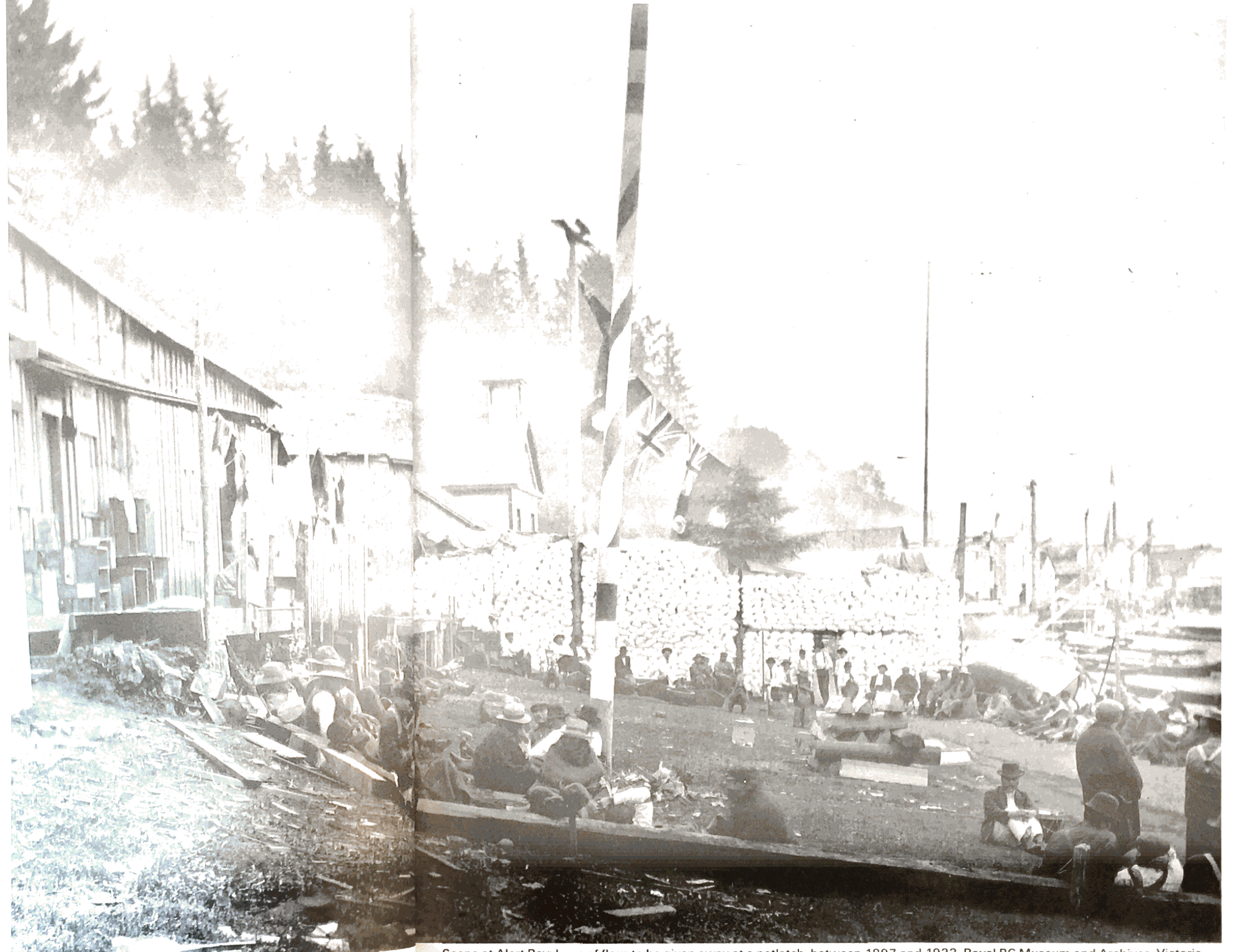
Scene at Alert Bay; bags of flour to be given away at a potlatch, between 1897 and 1933.

During the ban, potlatches went underground, where their outward character was disguised. At times potlatch goods were given at Christmas time as "presents," while in the 1930s communities began hosting deliberately disjointed ceremonies: dances and speeches were held on separate days from the distribution of goods (gift giving was banned when undertaken in the context of ceremony). At other times, potlatches were modeled on the giving of relatively banal European goods: the 1,500 sacks of flour in this image, for instance. In place of the usual potlatch rituals that accompanied distribution, when giving the sack of flour shown here, the offerer simply said, "Here is some flour to help you over the hard winter." Christian ideas of charity were also added to the ceremony to dispel any concerns over questionable behavior. This was a calculated decision, given that these native communities had notoriously resisted assimilation to Christianity. Nevertheless, this choice provided the guise of conversion while the communities quite transparently car-