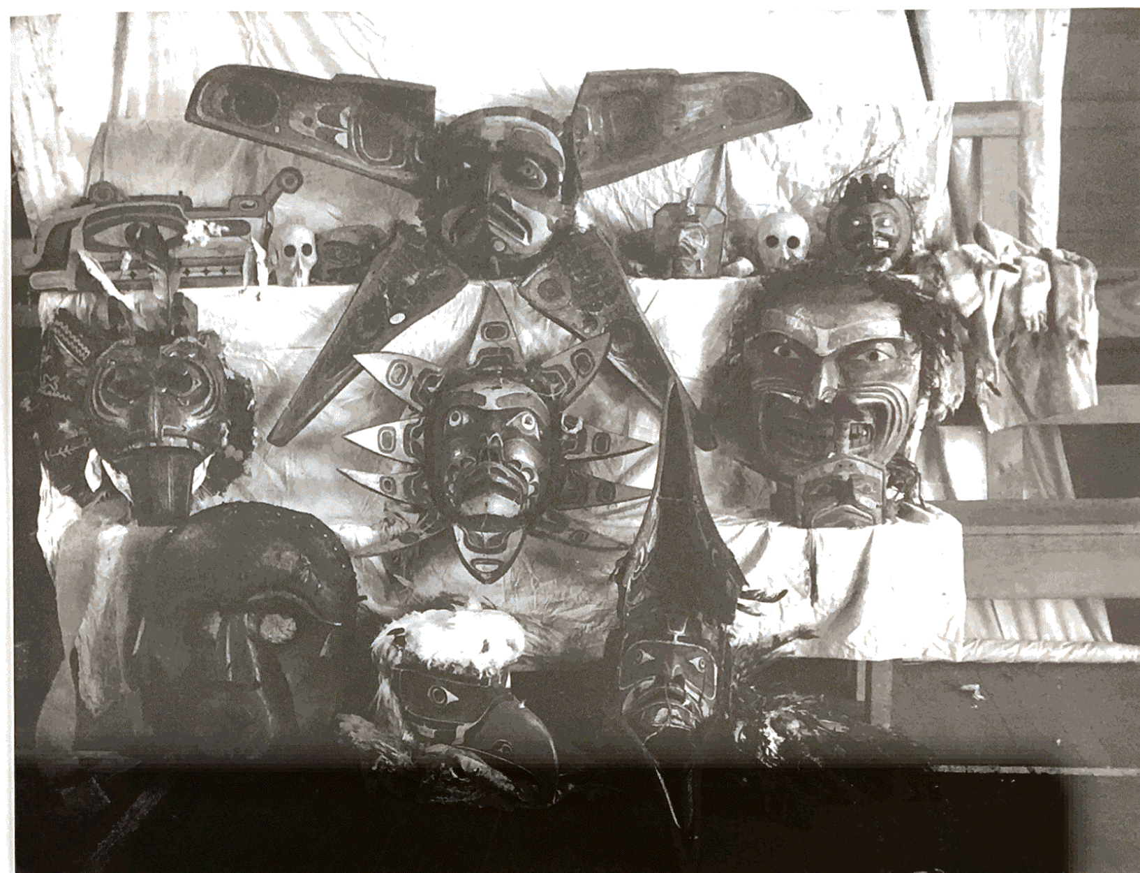
A collection of dance masks, Anglican Church parish hall, Alert Bay, BC, ca. 1922.